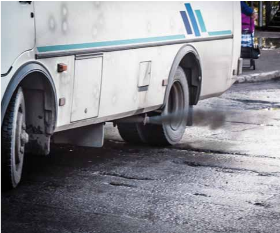
Figure 4. Exhaust emissions from an old bus.

Bus fleet upgrade by Murmanskavtotrans reduced black carbon emissions by more than 1,050 kg per year. In addition to BC emission reductions, the fleet upgrade helped reduce NO x emissions by about 24,500 kg per year. CO 2 emissions were also reduced. The total BC emissions