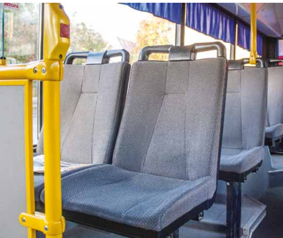
Figure 3. Passenger compartment inside a new bus.