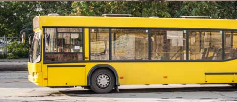
Figure 2. Euro V buses used in Murmansk region.